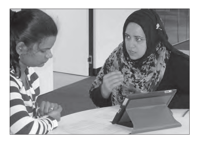
CAE students working on pronunciation

Real pronunciation problems in an otherwise skilled individual, for example, can have devastating effects on their life prospects. For some, it is the most important facet to language learning, along with understanding of cultural conventions. I'm really trying to improve the way I teach pronunciation, especially intonation and rhythm, which can be fairly slippery to work with, but so important. Similarly, digital literacy is another area for development and I welcome its inclusion in the new CGEA. Digital literacy has to be given a focus and as teachers we need to keep learning and moving with the changes.