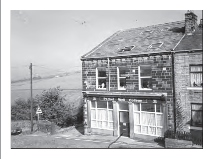
Pecket Well College Building, Pecket Well, West Yorkshire

Pecket Well became a charity and company Limited by Guarantee. Its constitution always stated that the majority of directors must have literacy difficulties themselves. Other directors were welcomed, including academics, community workers and educationalists committed to