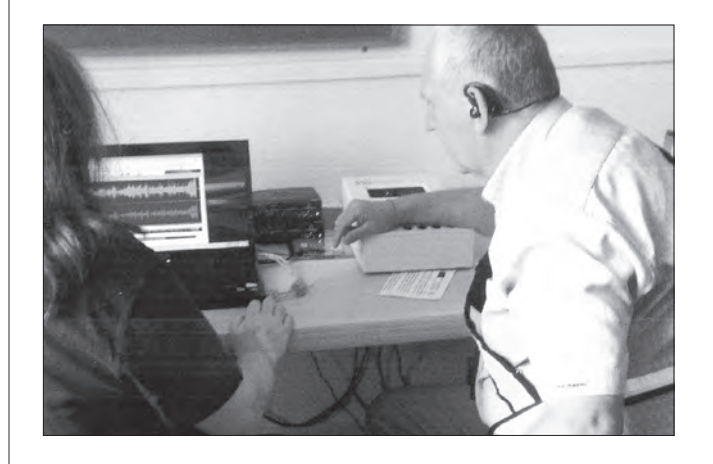
Converting audio files to digital format

I have seen the oral history and archive take shape in the Pecket Way: the developing of trust, and troubles that are involved when people try to do things together, respectfully; the slow process of discussion and understanding that builds, and the need for everyone to stand back as an individual at different points to allow the collective process to come forward; being patient, attentive to one another and