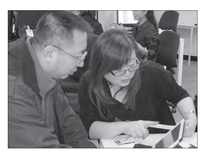
CAE students using Moodle

(DELTA) Cambridge. One of the benefits of the course was having somebody watch my teaching again with a critical eye and give constructive feedback.